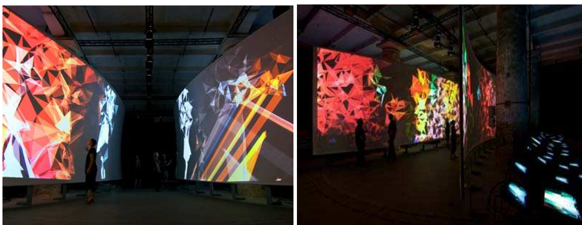
Hall of Fragments , the central aisle.

The Hall of Fragments is an installation by David Rockwell & Associates produced with the collaboration of Reed Kroloff and Casey Jones. It was presented at the 11th Architecture Venice Biennale in 2008, where it was selected as overture of the whole exhibition. Significantly, the exhibition was entitled Out there – Architecture beyond Building , a theme which recalls the idea of going out of a disciplinary precinct, as if the movement beyond its borders represented the necessary step in order to focus on it. The work is composed by a structure shaped as an aisle made up of a projecting surface; the subject is expressly invited to pass through this space, which develops just in front of him.