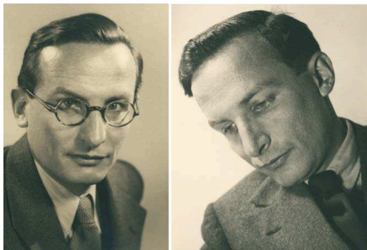
Figure 4. Rudolf Arnheim during his Italian years

Beyond the humorous dimension of this enjoyable article, its sarcastic – even sardonic – tone shows a certain resistance to innovations and implies a critique of “talkies” (that is, to the introduction of speech), censorship, star-mania, and formalistic style. At the same time, the article extols the “wonders” of technique and implies a challenge to it: technology must be used to achieve a more artistic result, rather than mechanically reproduce reality.