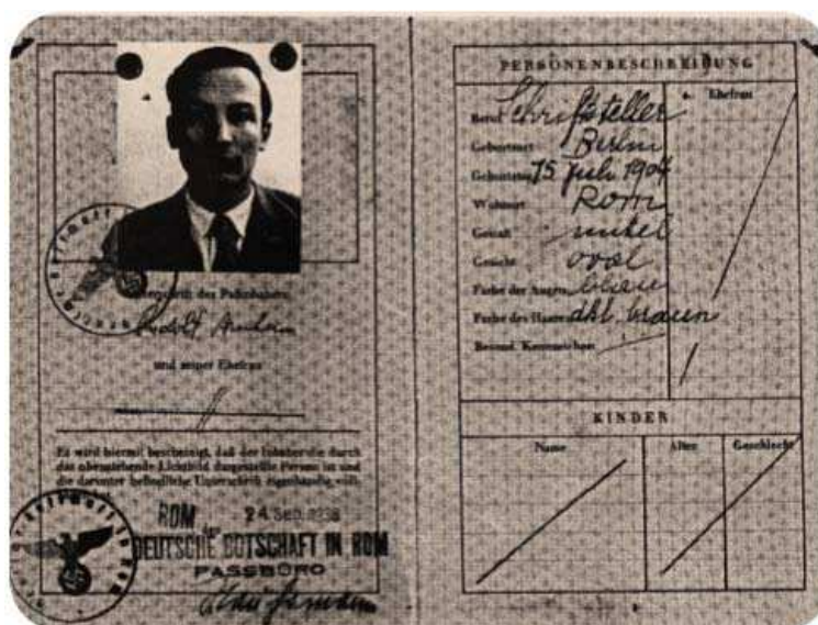
Figure 5. Rudolf Arnheim's passport during his Italian years

the country. If one places the last pages of his Italian diary and those of his passport side by side, an incredible story emerges: we gain an understanding not only of the impact of history on his private concerns and anxieties in those months but also a private and personal perspective on some momentous events in world history 31 .