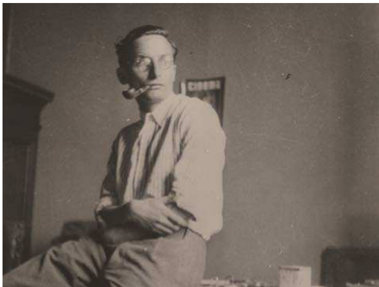
Figure 2. Rudolf Arnheim in the Cinema editorial office (Rome, 1938)

Nostromo 15 , the author of the correspondence with the readers, in a column called “Capo di Buona Speranza”, which was first erroneously attributed to Francesco Pasinetti 16 .