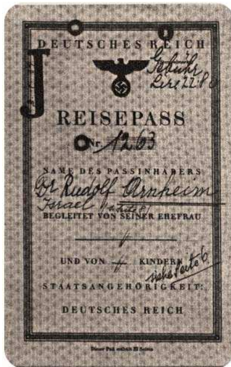
Figure 6. Front page of Rudolf Arnheim's passport during his Italian years

The nightmare was turning into reality, and this final diary entry sounds like a premonition: the climate in Italy was becoming darker, as political events turned for the worse. On January 3, 1939, he went to the German embassy in Rome to extend his passport. That day, a disturbing “J” was printed in red on the front page of the document, an indelible mark of his Jewish origins. In early 1939, still in Rome, Arnheim applied for assistance to the German Jewish Aid Committee 34 . On 25 April, he obtained a visa for the United Kingdom, and on May 3, 1939, he requested a free transit-visa to the Consulate of France in Rome in order to embark for England. Within a few days, he left Italy.